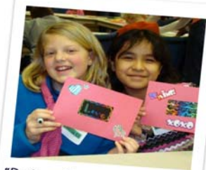
"Doing fun art stuff."