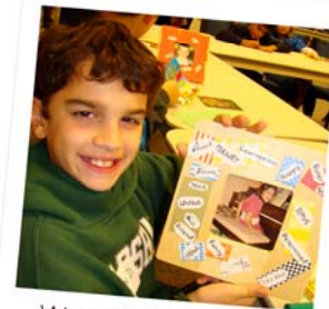
We can talk about our brothers or sisters.