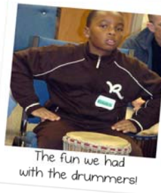
The fun we had with the drummers!

Look for the next Session of Sibshops to begin in September! If you would like more information please call: 832-6507 or email: support@fsncc.org