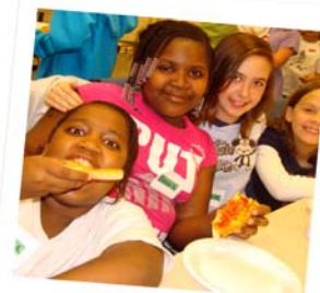
Being with friends & having fun!